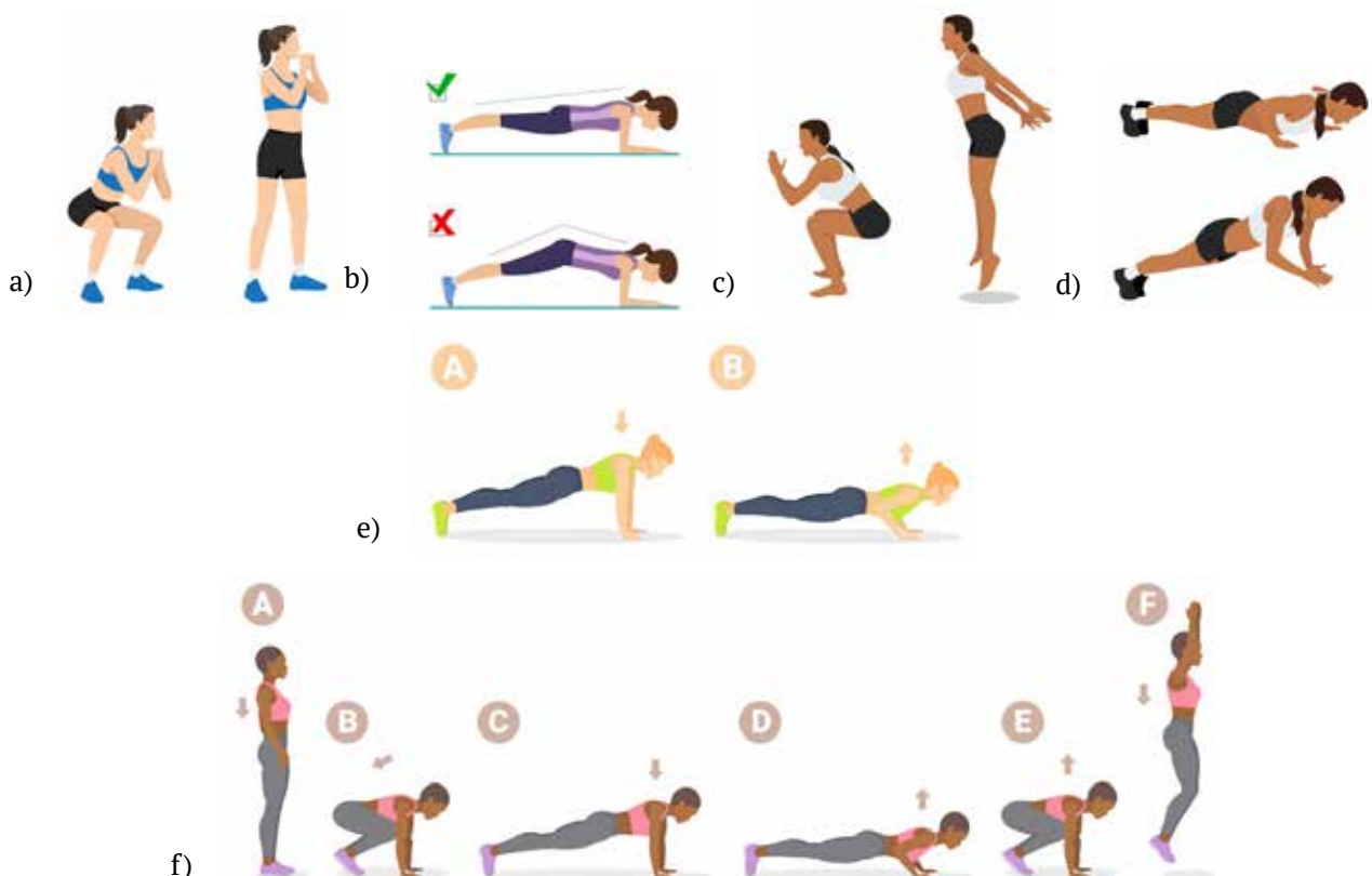
Figure 1. Battery of Tests

Testing was conducted at home by students under the control and guidance of the teacher via video link during the first three lessons. This approach allowed the physical education process to be adapted to the conditions of remote learning. It ensures an